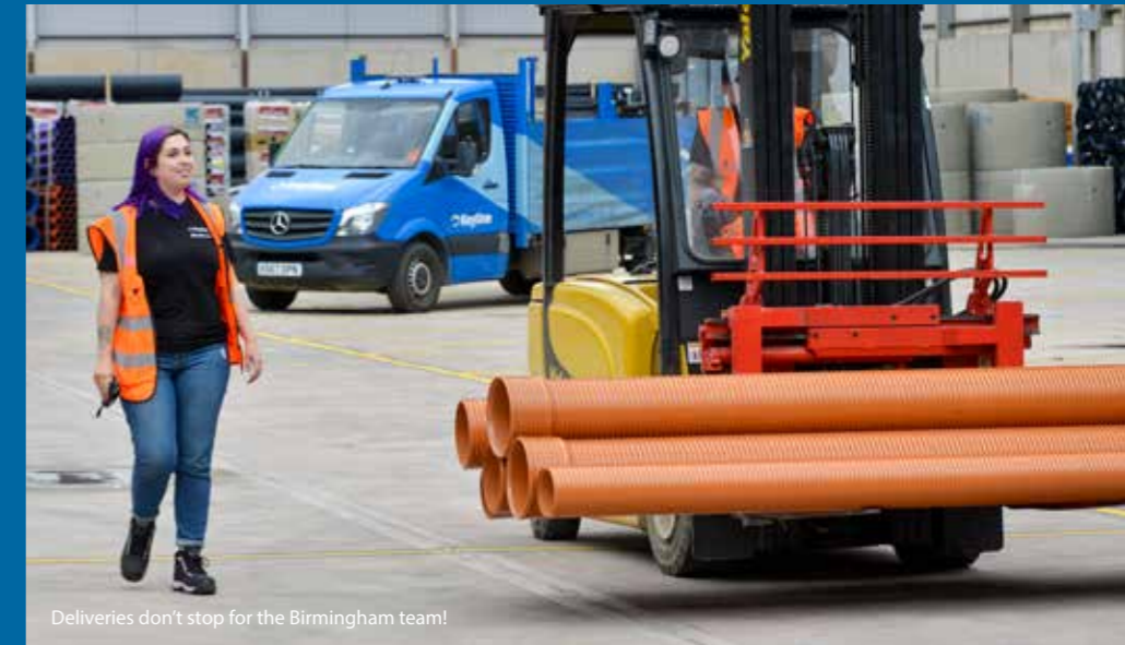
Deliveries don't stop for the Birmingham team!