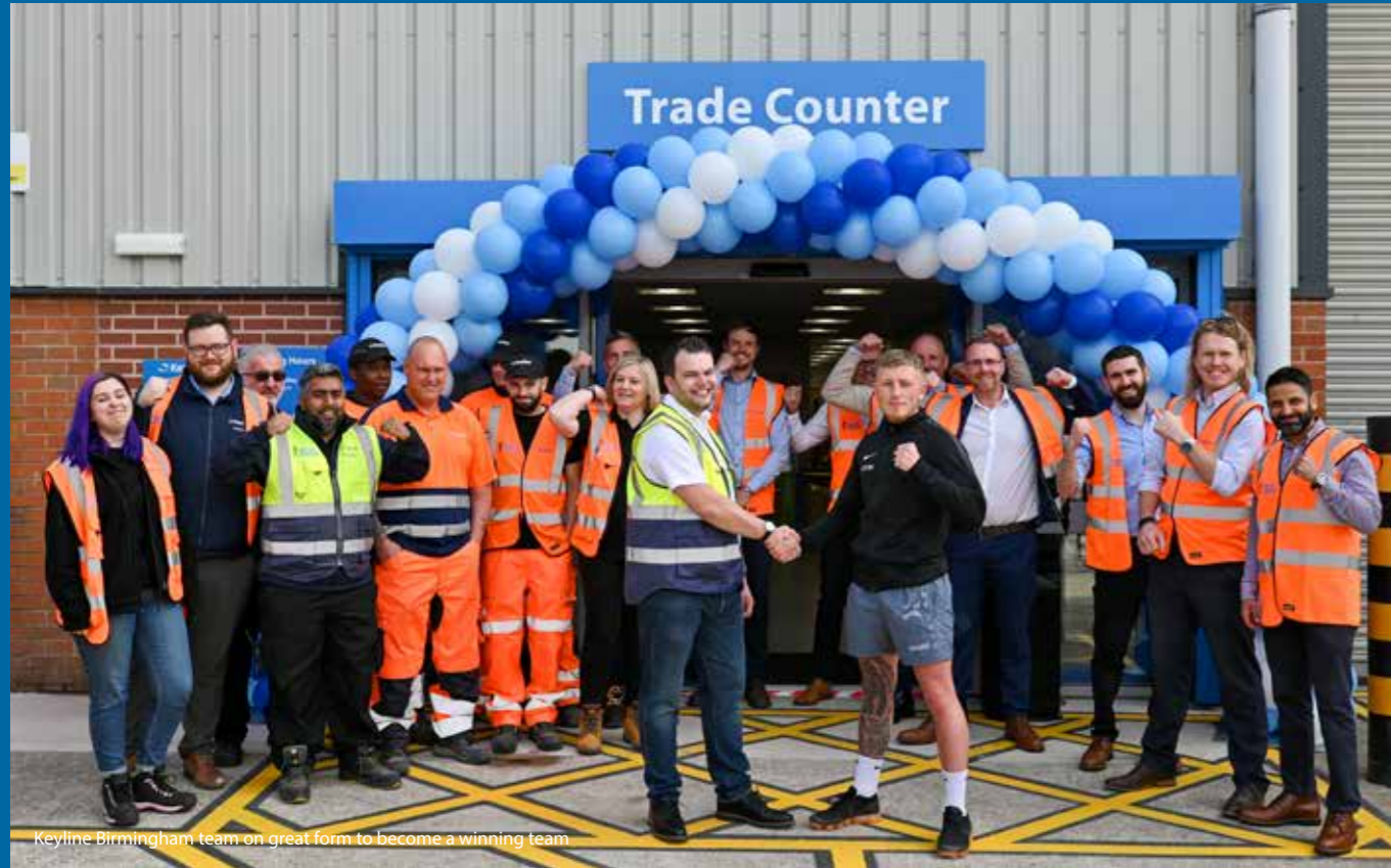
Keyline Birmingham team on great form to become a winning team

We're delighted to announce our new Birmingham branch is open for business! Located in Great Barr with easy access to the M6, its three acre site has huge stock capacity, with extensive warehouse space and external storage.